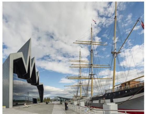
^The Riverside Museum