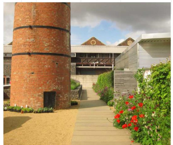
^Tramway and the Hidden Gardens