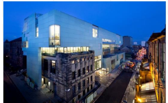
^The Reid Building at The Glasgow School of Art