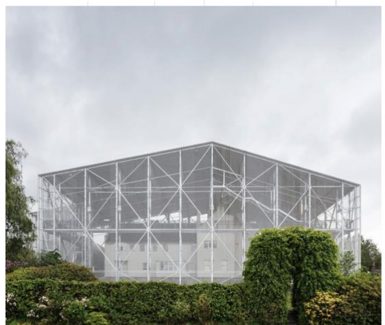
^The Hill House