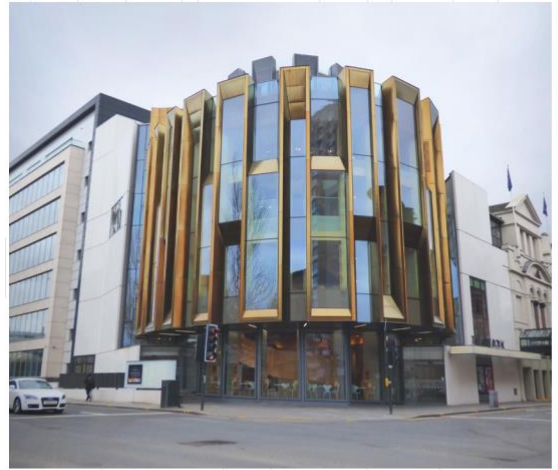
^The Theatre Royal