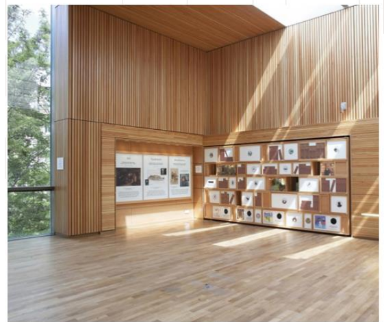
^The Scottish Storytelling Centre