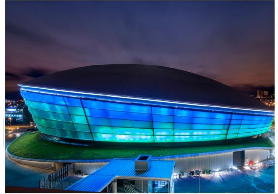
^The SSE Hydro