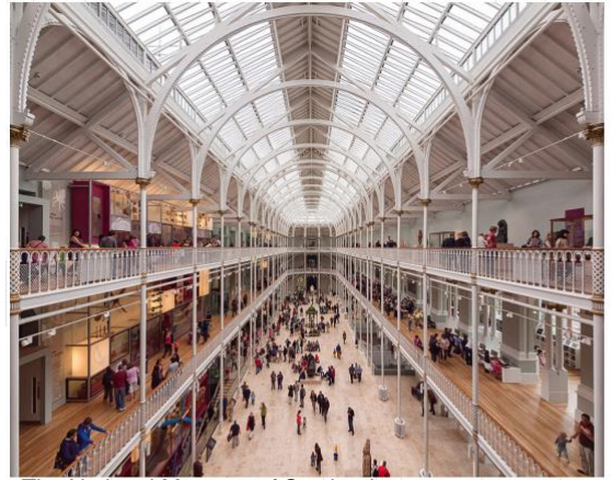
^The National Museum of Scotland