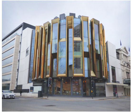
^ The Theatre Royal