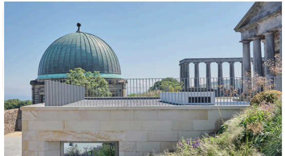
^ Collective Gallery