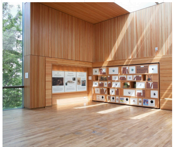
^ The Scottish Storytelling Centre