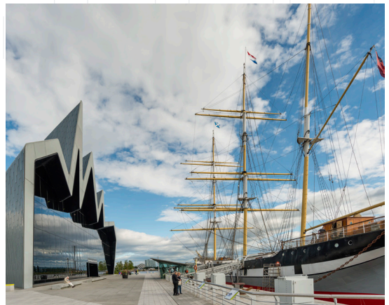
^ The Riverside Museum