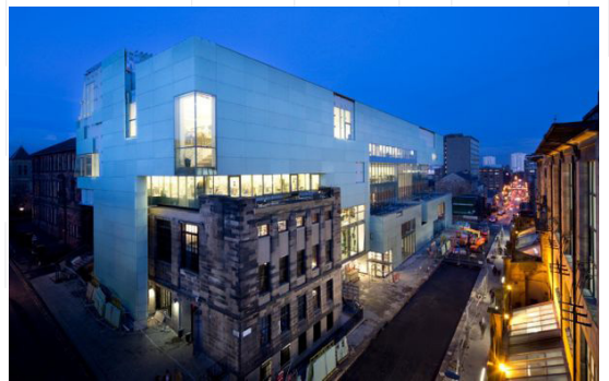
^ The Reid Building at The Glasgow School of Art