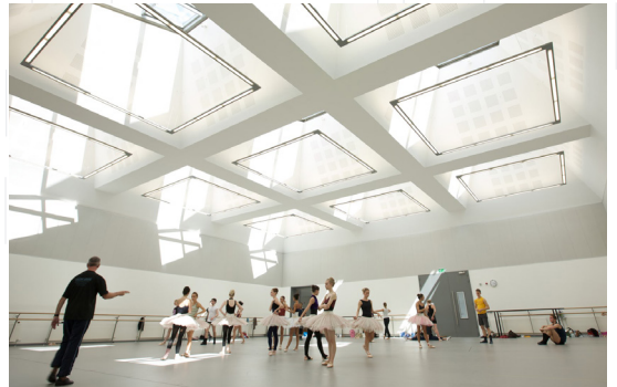
^ Scottish Ballet