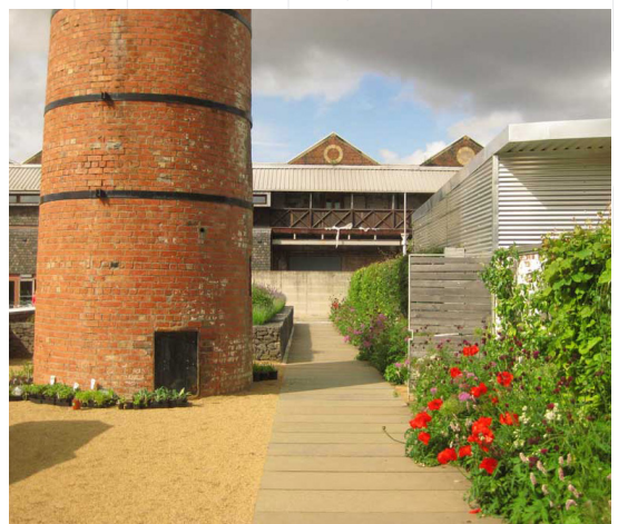
^ Tramway and the Hidden Gardens