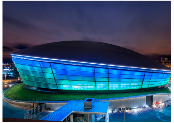
^ The SSE Hydro