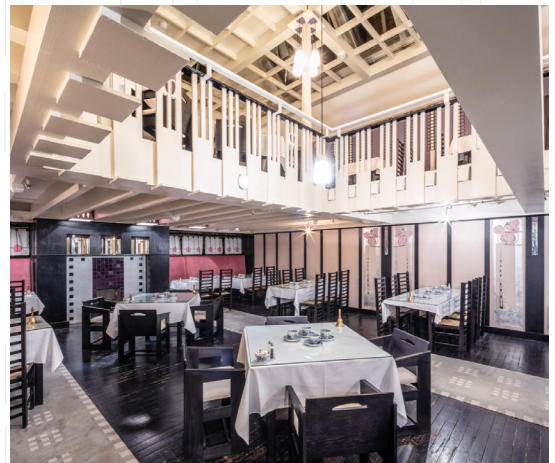
^ Mackintosh at the Willow