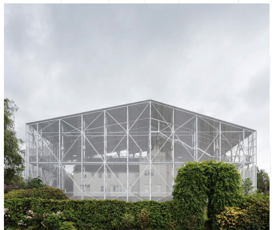
^ The Hill House